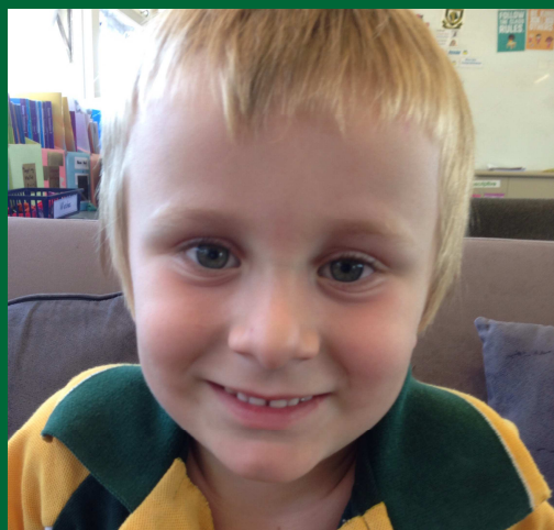
Week 4 - QUADE